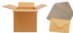
Cardboard, boxes, clean food packaging and cards