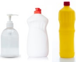
Bathroom and household cleaning with all tops on