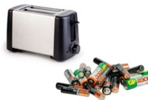
Batteries and waste electronics