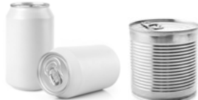
Food and drinks cans