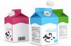
No cartons - e.g. Tetra Pak