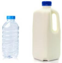
Plastic bottles - empty, wash, squash and lid on