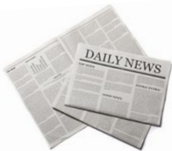
Paper and newspapers