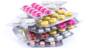
No pill packs