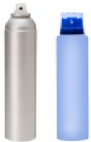
Empty aerosols - e.g. deodorant/ air freshener