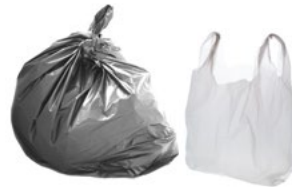
No black sacks, plastic bags or wrappers