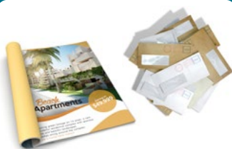
Magazines and junk mail