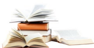
Books, paperback and hardback