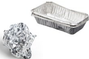
Aluminium foil and trays - roll foil into a ball